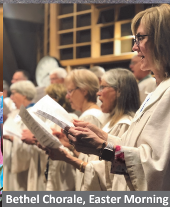
Bethel Chorale, Easter Morning