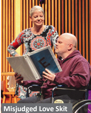
Misjudged Love Skit