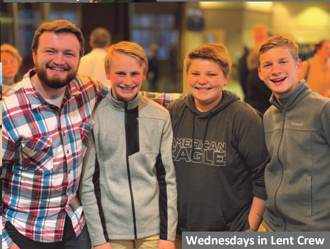
Wednesdays in Lent Crew