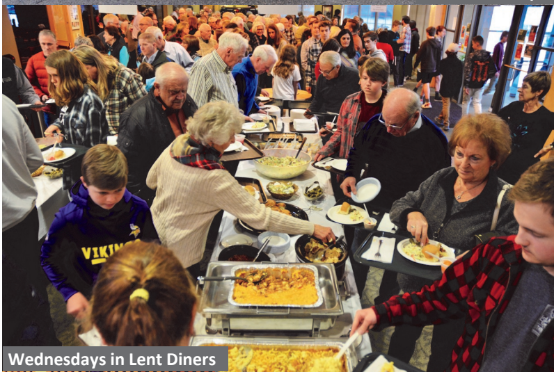
Wednesdays in Lent Dinners