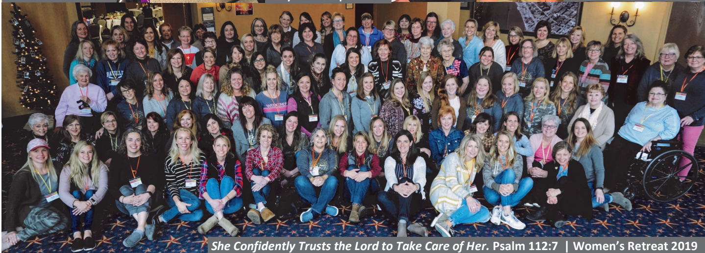
She Confidently Trusts the Lord to Take Care of Her. Psalm 112:7 | Women's Retreat 2019