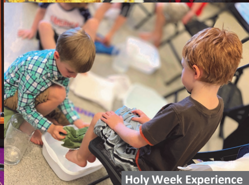
Holy Week Experience