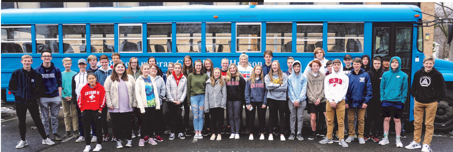
9th Graders' Spring Retreat